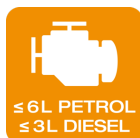
≤ 6L PETROL ≤ 3L DIESEL

New Boost function allows user to restart vehicles with depleted batteries